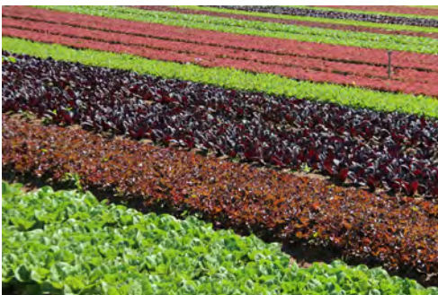
California Leafy Green Products

Many groups are involved in projects to improve water quality, but assessing the extent and impact of these efforts has been limited due to insufficient data collection. The development of a "Central Coast Action Tracker (CCAT)," web portal addresses this need. Leading a process with stakeholders, we designed an interactive web-tracking interface that eases reporting and presents regional project information in a compelling way. A valuable tool to help us better understand where projects are occurring and the level of effort by watershed, CCAT will be useful for strategic planning and evaluating the success of conservation efforts.