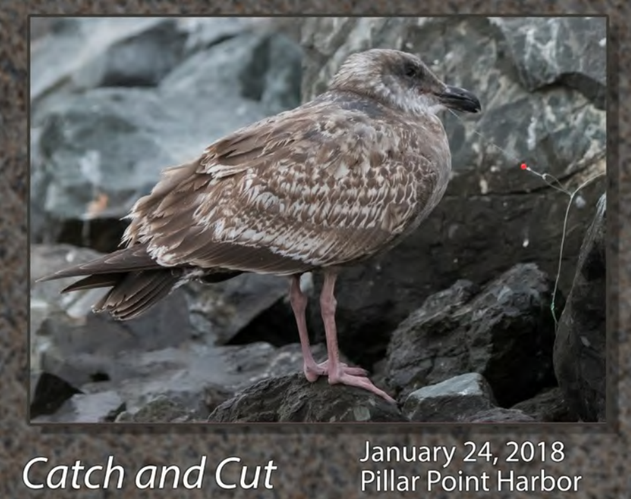
Catch and Cut Young Western Gull