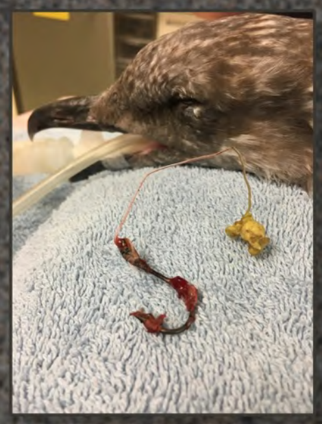
January 28, 2018 Surgery at IBR