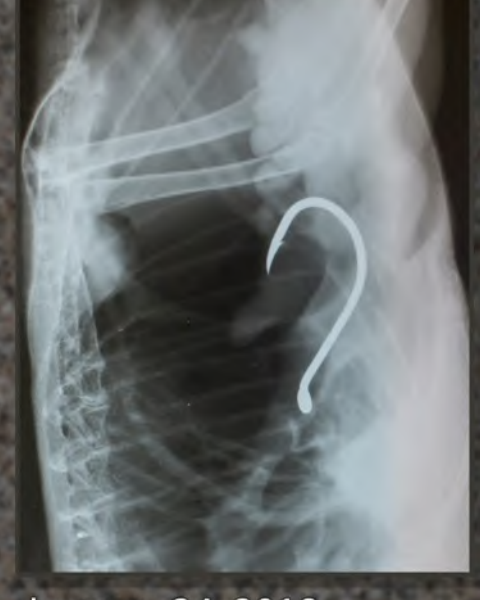
January 24, 2018 Triage at PHS